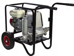
TD200 with trolley